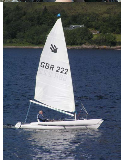
"Eee! That's our Champion."